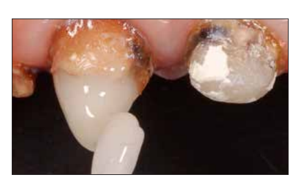
Fig. 5: Mutiple extensive carious lesions.